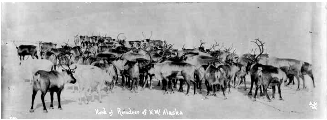
Anchorage Museum of History & Art. Library & Archives.