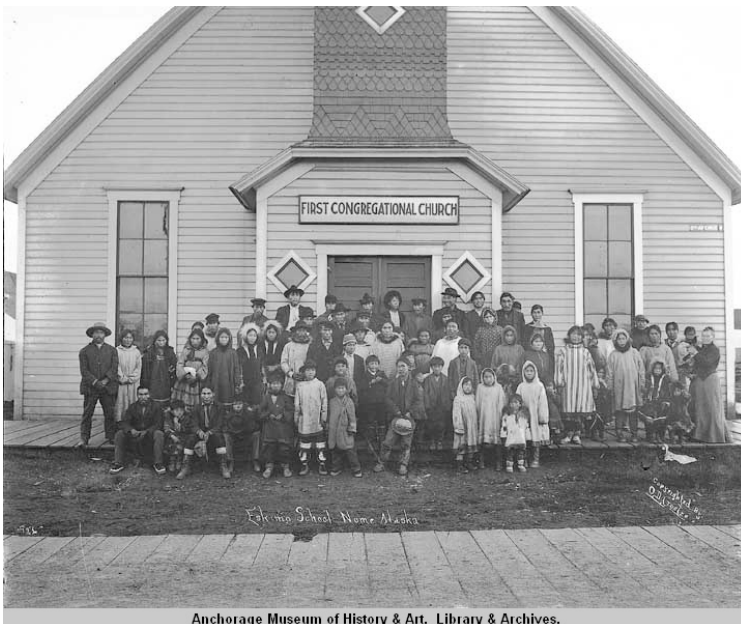
Anchorage Museum of History & Art. Library & Archives.